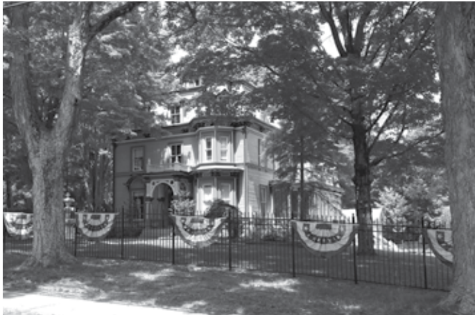
Coming Spring 2017, a new bed and breakfast, the Bevin House! For more info go to: https://www.facebook.com/thebevinhouse/