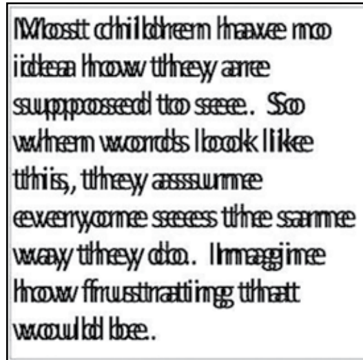
This is how some kids see the world; some adults too. It can be a life changing event to get sharp vision. Call for an appointment.

Diabetics, who should have their eyes examined every year, are at risk of serious vision loss if their diabetes is not controlled. Annual retinal eye examinations are required by all endocrinologists and physicians to confirm that medications are working as prescribed. Glaucoma is a silent eye disease that, if undetected, can also lead to serious vision loss. Early detection and treatment is critical to prevent permanent vision loss. As with diabetes, over half of the people suffering from glaucoma don't know they have it. Macular degeneration, which leads to loss of central vision, may be the most serious and most difficult eye disease to control, but with early detection and treatment, its progression can be slowed significantly. All of these eye diseases have hereditary components, so if someone in your family has had the disease, your chance of developing it is greatly increased. The confocal laser imaging systems at the Palmer Eyecare Centers have the highest resolution available anywhere to detect the earliest changes in your eyes so that we may intervene to safeguard your vision.